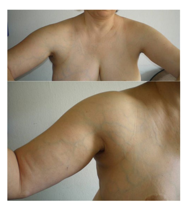
Figure 4: A 41-year-old woman with a diagnosed Paget-Schroetter syndrome 6 weeks ago. Clinical pictures showing diffuse swelling and dilated prominent veins on the right side of the chest, shoulder, arm and breast.

Furthermore, Paget-Schroetter disease, also known as Paget-von Schrötter disease, or primary 'effort-induced thrombosis' remains largely an unfamiliar disease and the incidence of patients leaving the hospital undiagnosed is high. It is a form of upper extremity deep vein thrombosis, a medical condition in which blood clots form in the axillary or subclavian veins. They have the potential to cause a pulmonary embolism. The syndrome is commoner in young people who are engaged in competitive sports. It is differentiated from secondary causes of upper extremity caused by intravascular catheters. Symptoms may include sudden onset of pain, warmth, redness, blueness and swelling in the arm (Figure 4).