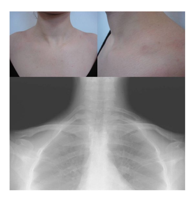
Figure 2: A 22-year-old woman complained for a painless bony lump over the medial border of the left clavicle. Physical examination revealed brachial plexus nerve compression symptoms that were more expressed in the left side, though they were also present on the right side too. The radiograph showed fully developed symmetrical cervical ribs originating from the seventh cervical vertebra. A joint process of the first rib at the place of insertion of the cervical rib was clearly evident on the left side. The cervical column was not abnormally shaped.

History, physical examination, provocative tests, ultrasound, radiological evaluation and electrodiagnostic evaluation are essential in the diagnostic investigation of TOS. Compression of the brachial plexus may be identified by pain, muscle spasm, weakness and a 'pins and needles' feeling and/or numbness, aggravated by overhead positions of the arms, in the cervical region, shoulder, arm, forearm or hand. Tenderness of brachial plexus in the supraclavicular area and occasionally painless wasting of intrinsic hand muscles may be evident. Compression of the subclavian artery results in pain, coldness, and paleness of the arm, while compression of the subclavian vein results in swelling, pain, and possibly a bluish coloration of the arm (Figure 3).