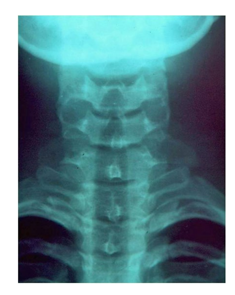
Figure 1: Cervical plain radiograph of a 10-year-old girl indicated elongated C7 transverse process on both sides that was more pronounced and symptomatic on the left side.

Common local anomalies include an elongated transverse process of the seventh cervical vertebra, variations in the insertion of the anterior scalene muscle (ASM) or scalenus minimus muscle, the presence of a cervical rib, fibrous and muscular bands or hypertrophic scar tissue after clavicle fracture, variations in insertion or local hypertrophy, in athletes, of pectoralis minor, atypical course of neuro-vascular structures or abnormalities of the first thoracic rib. An elongated transverse process of the seventh cervical vertebra is the most commonly recognized cause of TOS (Figure 1). It is considered elongated if it extends beyond the tip of the first thoracic vertebra process immediately below it, as seen on cervical radiographs. A fibrous band connecting it to the first rib may also be evident.