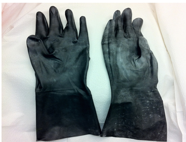
Figure 2: Lead gloves.