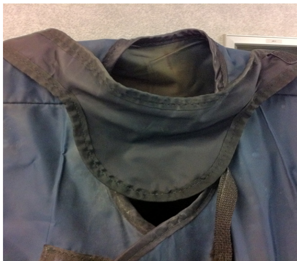
Figure 1: Standard vest and thyroid shielding.

Radiation protection aprons, two piece garments and thyroid shields are routinely available. (Figure 1) However, lead glasses and operating room shielding is not commonly available. A Yeung built the first spine focused ambulatory surgical facility in the United States in 1998. He installed ceiling mounted lead shields in his operating rooms. Yeung anticipated the need for radiation safety due to the large number of endoscopic spine procedures being performed. Image guidance equipment such as ultrasound for the guidance of needles, and robotics, was not yet available for reducing radiation exposure. It was realized that radiation exposure would need maximum protection for the surgeon as well as the operating room personnel. A separate monitor measured room radiation with and without lead shielding of equipment estimated there was a reduction of 85% in and around the operating table with lead shielding and protection worn by the surgeon.