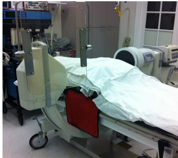
Figure 3: OR table shielding and overhead mounted lead shields.

ceiling added to shield the surgeon's face from scatter radiation, (Figure 3) over 85% of scatter radiation is eliminated to Surgeon and or personnel in addition to their the personal protective equipment.