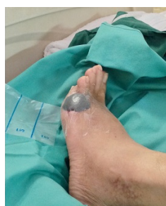
Figure 2: Foam fit into wound

The V.A.C. VeraFlo dressing was cut to fit the size and shape of the wound.