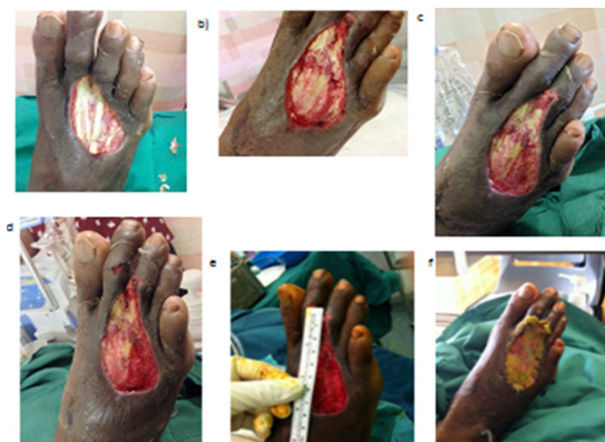
Figure 5: (a) Right dorsum ulcer, upon application of V.A.C. Ulta, day 5 post-operatively (b) During V.A.C. VeraFlo therapy, day 8 post-operatively (c) During V.A.C. VeraFlo therapy, day 12 post-operatively (d) During V.A.C. VeraFlo therapy, day 14 post-operatively (e) End of V.A.C. VeraFlo therapy, day 18 post-operatively (f) Wound closed by split-skin graft.