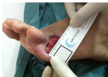
Figure 1: Measurement of Wound.

Investigations performed and documented included markers of healing (Glycated Haemoglobin - HbA1C, hemoglobin count and albumin level) and markers of infection (leukocyte count, C-reactive protein and erythrocyte sedimentation rate). A tissue specimen was taken from the wound and sent for culture and sensitivity.