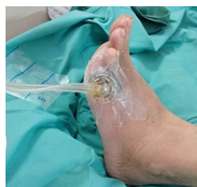
Figure 3: VeraT.R.A.C. Pad over the wound.

The V.A.C. Vera T.R.A.C. Pad was placed directly over the hole in the film to allow for the delivery and removal of topical wound solution to the wound bed.