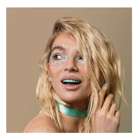
Figure 2: The teeth have been colored turquoise green to match painted finger nails and the neck "ribbon-choker." [6]

"White Teeth Are Out, Rainbow Teeth Are In!" posted by Chuck Nowlin -Oct 25, 2018. [6]