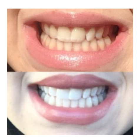
Figure 7: Teeth before and after dental bleeching. The teeth are much lighter after treatment and should last a long time. (Hartley Dental using Boutique Whitening. Whitening. https://www.hartleydental.co.uk/dental-health/teeth-whitening/[17]

Bleeching using carbamate peroxide or hydrogen peroxide and other bleeching agents (like acids) are used to whiten teeth. Sensitivity is a common complication of this and the bleeching is not permanent. This is a form of Cosmetic Dentistry, [17]. For example: See Figure 7.