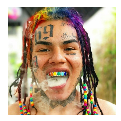
Figure 4: Six different tooth colors applied to the anterior maxillary incisors and canines. [Rainbowteeth-Hash Tags-Deskgram 2018] [6]

This commercial fashion promotes "Rainbow colors' with the use of a Coloring Tooth Paint, or Chrom Tooth Polish (CTP) that covers the teeth. Shades, tints and tones of white are "out" and bright colored hues are "in". The CTP application dries on the teeth and purported to last 24 hours. CTP is similar to nail polish and colored pink, blue, green and blue.