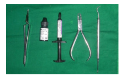
Figure 1: Armamanterian used for bonding.

Extracted teeth were stored in 0.2% thymol solution. The extracted teeth were mounted on a jig of cold cure acrylic roughly keeping the bonding surfaces parallel to the long-axis. Our study involved following steps: New metallic orthodontic brackets were bonded on the freshly extracted teeth. The debonding of those brackets with help of Instron machine to calculate the shear bond strength of the first debonding which was considered as the "control group". The debonded brackets were recycled with four different techniques and then rebonded by three different rebonding methods.