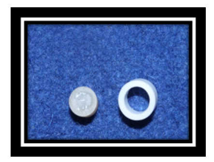
Figure 1b: 6mm x 6mm Cylinders with everX Posterior core (4 mm) and Solare X overlay bonded to dentin disks.