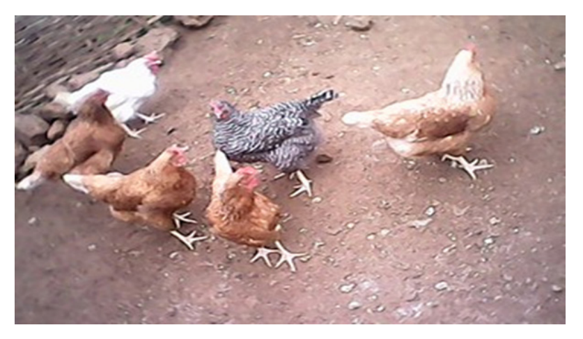
Figure 2: Bovans Brown, Bovans White (commercial layers) and Potchefstroom Koekoek (dual).