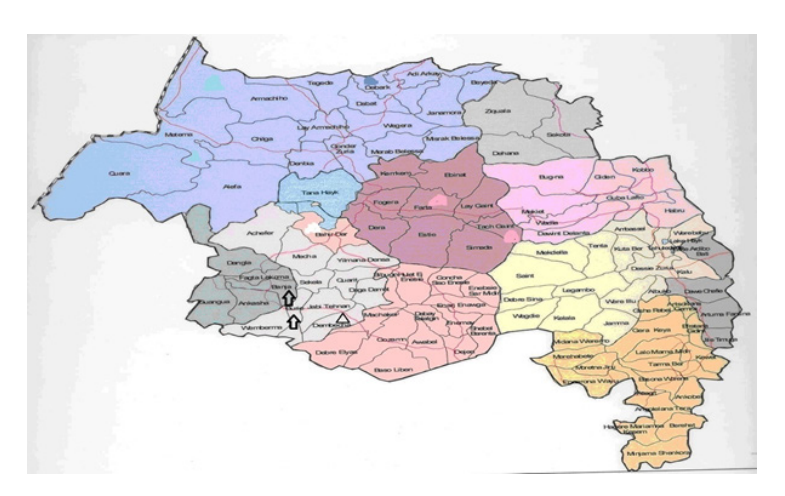
Figure 1: Map of the study districts are indicated by arrows.