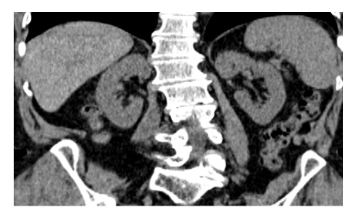
Figure 1: A fragment of native CT scan of the entire human body.