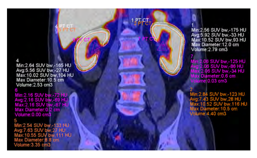
Figure 3: PET /CT of the kidneys with 11C-choline ( digital ranking of SUVmax kidney parenchyma ).