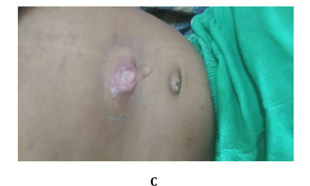
Figure 2c: Leakage from incision point.