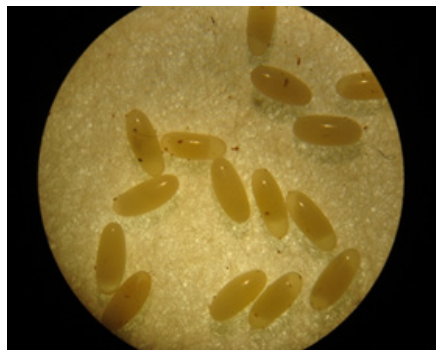
Figure 1: Eggs of RPW.

Morpho-taxonomic appearance of different life stages, egg, larvae, larval stages, cocoon formation, adult (♂:♀) and mating behavior under laboratory conditions