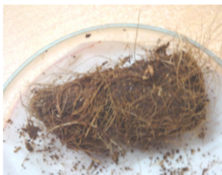
Figure 4: Cocoon which posse's pupae.