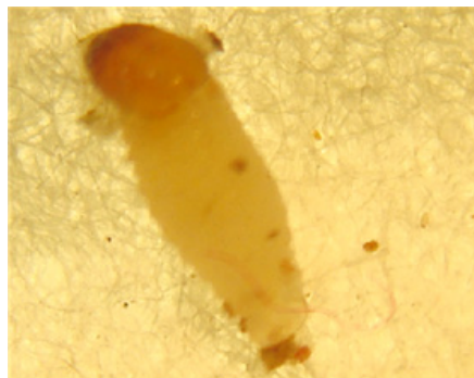
Figure 2: First instars larvae after hatching.