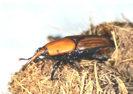
Figure 5: Adult of RPW emergence from cocoon.