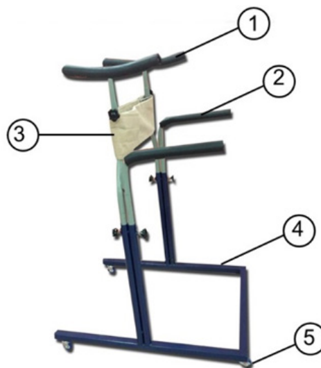
Figure 2: The component of this invented postural enhancing wheel walker.

The invented postural enhancing wheel walker is designed to help patients walk independently. There are several important components, as shown in Figure 2, which consists of the axilla support bars of the device that stimulate the body and supports the axis, the handle, the belt, the body, the base, and the wheels. It allows the patient to move the device in different directions. The front wheel can be rotated for the benefit of turning. The rear axle is locked in a straight alignment only to assist in steering and can be adjusted to suit the individual's ability. The axilla support bars of the device stimulate the body to stabilize and support the body, adjusting the low and high levels, and stimulate the patient to align the body. With a large fabric belt attached to the axis of the device to help stabilize. The axilla support bars and the large fabric belt with straps will also action as somatosensory cue for enhance walking ability. The handles of the device can be adjusted to low and high levels as appropriate for each patient. Patients can align their body straight, makes the balance of the body in the base of support. This invented postural enhancing wheel walker has a sturdy base that prevents any fall. By calculating the maximum load of the beams, the walker can support 1032.67 Newton (105.30 kilogram).