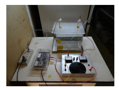
Figure 1: This show the entire set-up, i.e. The 300 Volts DC @ 50 micro ampere (limited) power supply unit to the left, the actual measuring instrument at the bottom right and a 10 litre tank filled with 9 litres of deionised water and containing two pure silver electrodes at the rear.

Both the electrodes in the tank as well as the potentiometer have the power supply in common and each a panel meter is in series connected. When power is applied to both systems it is likely to draw more current as compared to the other with less current. However by adjusting the variable resistor, a point is reached when the current through both system is equal and both panel meters show a half scale deflection at 25 micro ampere each. The resistance in this particular instance was 170,000 Ohm, just as the thought experiment had predicted. The water thus represents a resistance of 170,000 Ohm to the current flowing through it. Below is a picture of the experimental set-up and a composite picture of the comparisons between the settings of the parallel resistance factor: